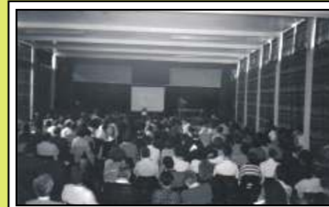
About 370 people attended our first "Creation Day" at Street, Somerset, in 1993, including 90 children, who were catered for in special sessions.