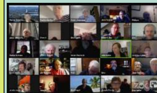
Participants taking part in a "Zoom" conference by Creation Ministries International

CRT has always been happy to support, and cooperate with the other UK creation organisations, and for a number of years we have been producing a quarterly Prayer Diary , listing all the creation meetings and events which are taking place. These events have been growing in number in recent years, and the creation movement is here to stay.