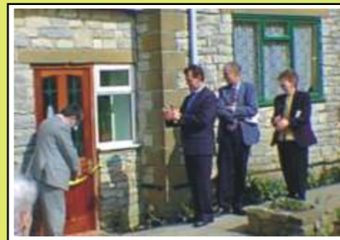
CRT's two-storey unit was opened on 28th March 1998

This was done through talks, "Creation Days" and seminars, books, literature and audio-visual aids. In 1985 we decided to publish a creation paper for children, called Our World , which is still going strong today, and is distributed throughout the UK and overseas. We have also produced a range of full-colour creation-based tracts. All our literature is supplied on a donation basis, so that people who wish to use it are not restricted by cost.